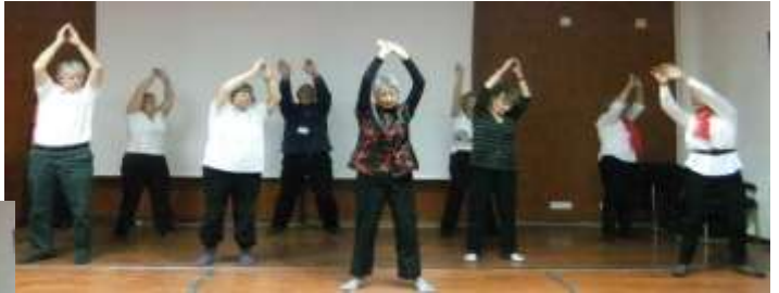
Warming up moves.....