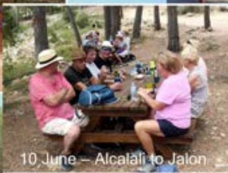
10 June – Alcalali to Jalon