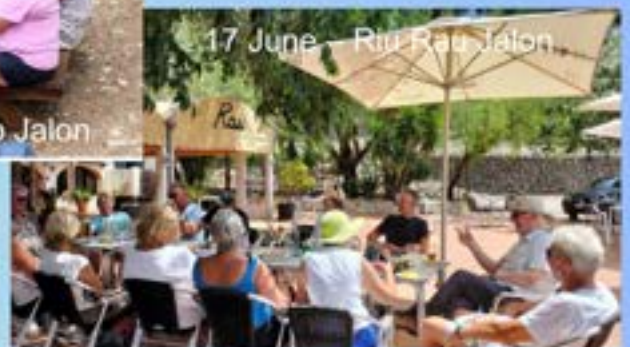
17 June – Riu Rau Jalon

We were fortunate this year that we did not have to cancel any walks because of the heat. In fact Monday's seemed to be cloudy/sunny rather than the full sun on most other days of the week. The sun can make a dramatic difference, as can the humidity. However with a little planning, and a lot of respect for the heat, it is still possible to enjoy moderate walking even in June and September.