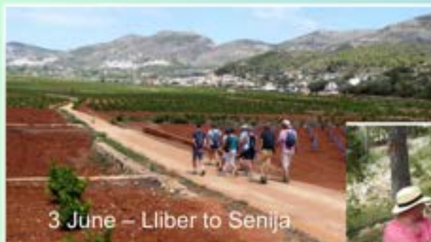
3 June – Lliber to Senja

We start our summer walks at 0800, and aim to finish by 1200. Temperatures are usually lower earlier in the day, and most days vary between 24-28c. This is still quite hot, but manageable if care is taken. We restrict our walks to the easier valley walks, reduce the pace and stop every 30 minutes for a water break. Our water and picnic stops are chosen to take full advantage of any available shade on each walk.