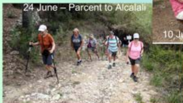
24 June – Parcent to Alcalali