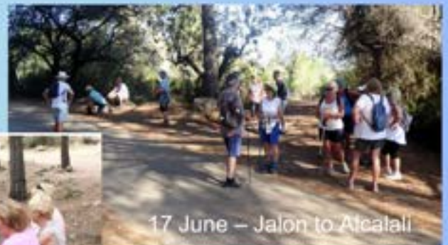
17 June – Jalon to Alcalali